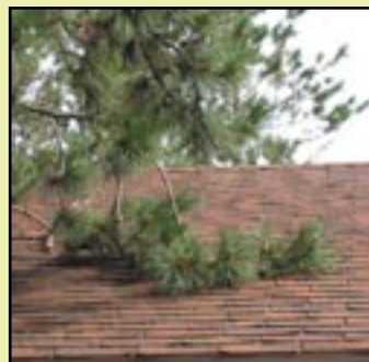
Trim all overhanging branches.