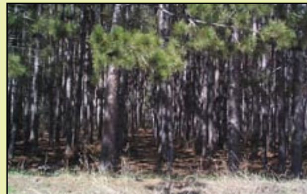
Pine rows need to be thinned.