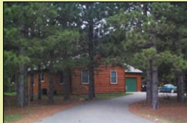
Log home in pines.